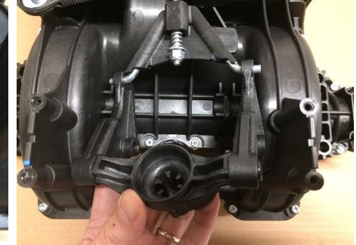
Installation of the new set