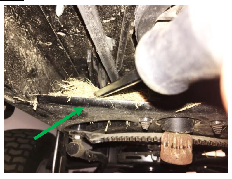
V- Once the debris is removed

IV- Remove any debris with a tool (screwdriver ) or by gloved hand