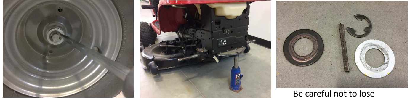
Be careful not to lose the hardware

Remove the clip using a flathead screwdriver.